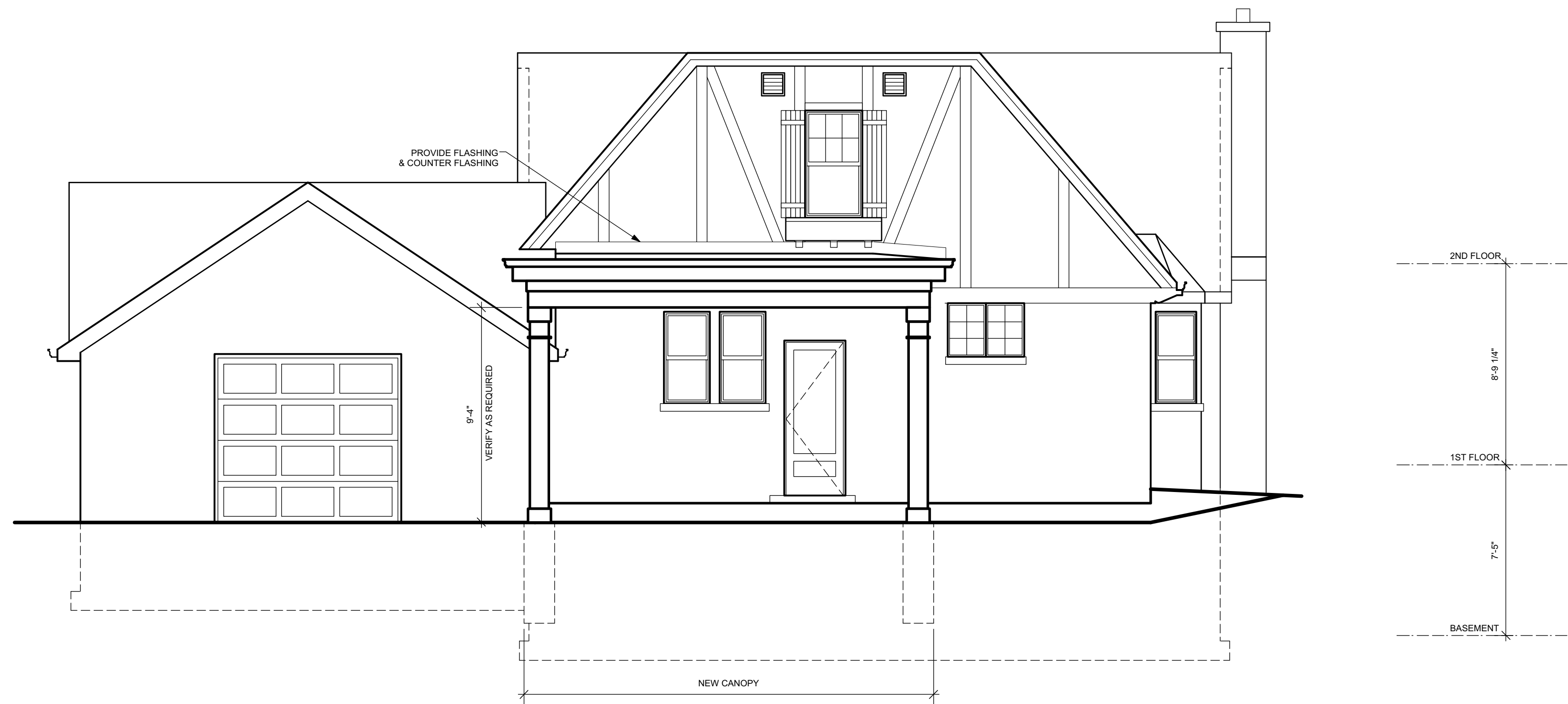
3 REAR (WEST) ELEVATION SCALE: 1/4" = 1'-0"